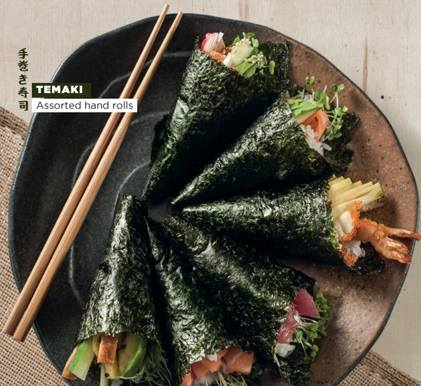
TEMAKI Assorted hand rolls