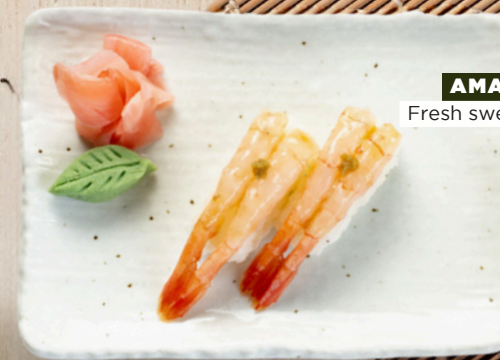
AMAEBI NIGIRI Fresh sweet shrimp on sushi rice